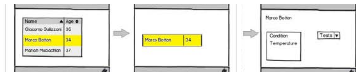
Figure 5: Highlight on departure (mock-up)

* Use a visual summary of the patient history. A thumbnail of the timeline of the patient history could be displayed next to the patient's photo. A visual summary is faster to "read" than a textual description of the patient's history. Instead of the full history the last two or three significant events in the time line might help clinicians distinguish between patients.