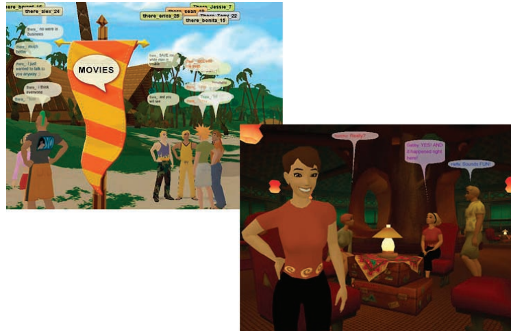
2 There.com provides avatars and text balloons to show chat discussion.

Web standards like VRML, which didn't generate huge commercial successes, have given way to richer ones such as X3D. This standard has major corporate supporters who believe it will lead to viable commercial applications.