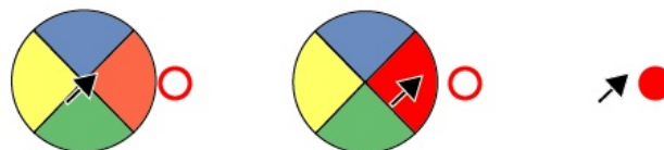
Figure 1: An illustration of how the pie menu works, first step the menu pops up, then the selection is highlighted, then it disappears and the selection is applied.

Pie menus are circular menus that allow the user to make a selection by moving the cursor in the desired direction, in the case of the project there are four. After the cursor is moved in one direction for a specific amount of the diameter (1/5 for the project case) the option in that direction gets highlighted and a click on it selects that option. The pie menu for this project should have a diameter of 40 pixels and be evenly divided in four sections for the four colors, the colors should be centered around the main compass directions (north, west, south, east). Once a selection is made, the menu disappears and the selected value is applied (if correct).