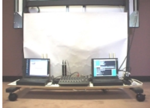
Figure 1: (Left) The front of DUMMBO. Notice the lack of any buttons, computer screens, or cameras. (Right) Rear-view of DUMMBO. The computational power of the whiteboard is hidden under the board behind a curtain

designed to operate like traditional whiteboards are easy to use only after a significant amount of training. Thus, they are not yet suited for effective use by casual and untrained users.