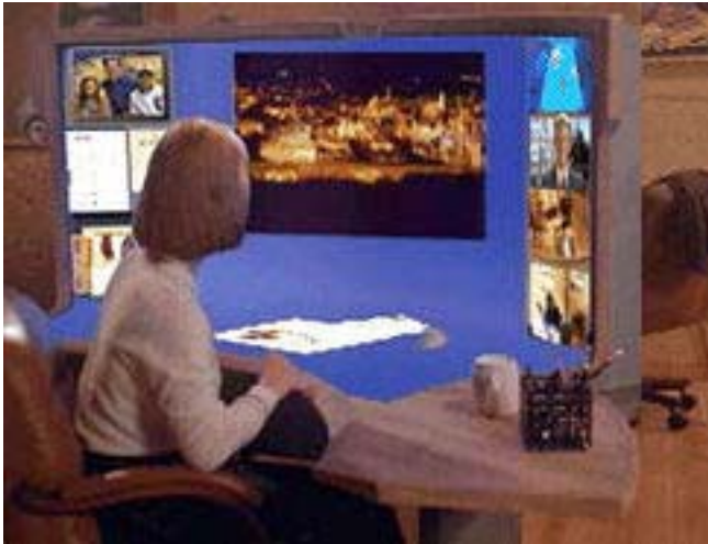
Star Fire (Sun's vision in '92)