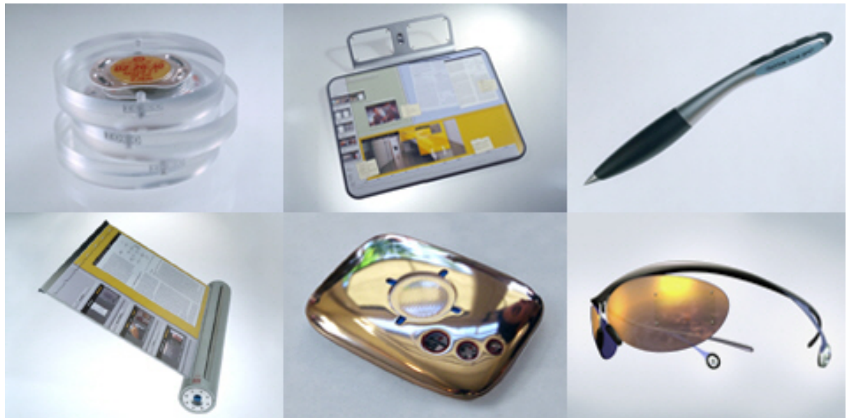
Connected products (IDEO vision in '00)