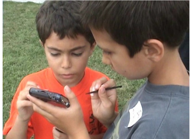
Figure 1 – Co-present collaboration on a shared story at Fort McHenry National Park in Baltimore, Maryland.

In the last two decades, mobile devices (e.g. cell phones, PDAs, etc.) have become more and more popular and ubiquitous [4]. In fact, it is anticipated that within the next three years, more than 2.6 billion mobile devices will be in use throughout the world [16]. In several places, mobile phones instead of landline phones have become the norm [3]. In developing countries, even those with struggling