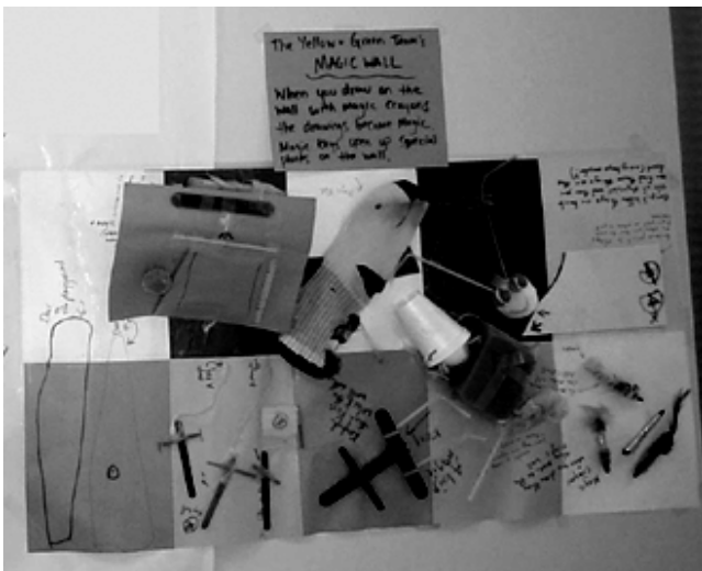
Figure 3. Low-Tech Prototype

The team continued to use these methods to redesign a toy, a backpack, robots and more. In all cases, the children: (1) interacted with a technology, (2) watched others interact with technology, (3) decided what they liked and did not like about the technology, (4) sketched their ideas for a new version of that technology and then (5) combined their best ideas to create a model of their new technology.