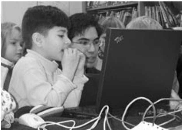
Figure 1. Working with our Kindergarten Design Partners

In the fall of 2001, we began a new technology design team with a kindergarten class (ages 4-6) at the Center for Young Children, a private preschool on the campus of the University of Maryland (See figures 1 and 2).