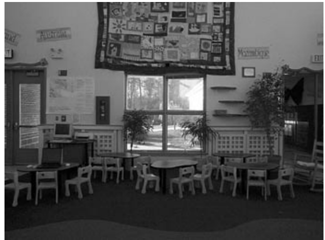
Figure 2. The Center for Young Children, Where We Partner with Children and Teachers

members of the team from the HCIL meet with both the CYC and the YES teachers every few months to discuss ways to continually improve our partnership.