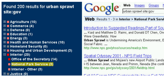
Figure 1. Detail of the expandable outliner condition, showing the tree control used to display an overview of all search results, limiting the list to the National Park Service.

subjective measures showed that the overview treatments were preferred and this was supported by user comments. They found the overviews significantly easier to use, more helpful, and more satisfying than the control, and they were more confident of their own success. They agreed more strongly that they had gained a good overview and found good examples of different perspectives. The results did not support the hypothesis that the overview tasks would be considered more complex and difficult to learn. Users found all three interfaces very understandable and fairly simple.