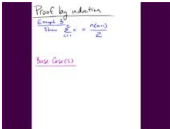
Figure 2: TMS Application student view with example notes for same proof as Figure 1 displayed.

In order for TMS to work, the TabletPC needs to have the screen extended to the VGA-out screen rather than having it mirror the tablet’s primary screen. The student view of the slides only displays the ink surface, not the toolbar and status bar. Since most projectors do not currently have the ability to rotate the image 90 degrees, I was inspired by the effect of “letter-boxed” movies to create the illusion of a portrait display. Figure 2 shows what is displayed by TMS in landscape-mode via VGA-out.