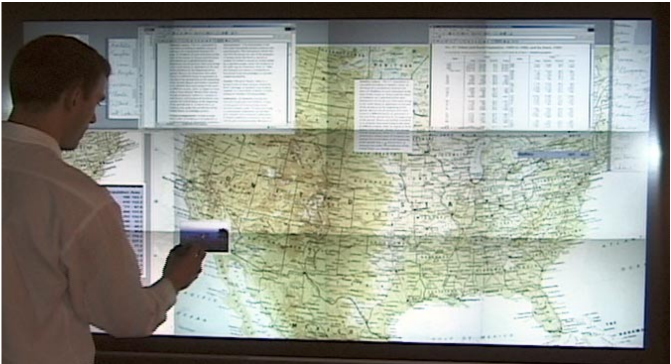
Figure 2: On this interactive wall, users can work with high resolution images, application windows, hand drawn material and information structures such as lists (upper right). The pen is used for all interactions including sketches and annotations directly on graphical objects or on transparent overlapping sheets.

interacting with a wide variety of information and applications. It is not enough to simply move existing GUI interfaces onto larger displays. Walls afford different kinds of interactions than workstations for several key reasons: The large visual display area can be used to work with large quantities of simultaneously visible material; interaction is directly on the screen with a pen-like device or touch, rather than with a keyboard and an indirect pointing device; and people often work in groups at a wall together, interleaving social and computer interactions.