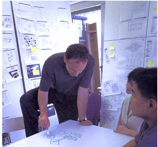
Figure 1: This design studio at IDEO illustrates the use of physical walls for displaying and working with large quantities of information. Note the diversity of information posted on the wall, from sketches to photographs to Post-It notes, and the abundance of printouts of digital media

Technology to stick stuff on physical walls is well developed. Papers can be annotated by writing directly on them,