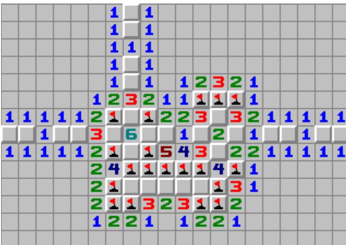
OR gadget for NP-hardness