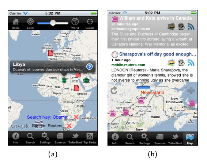
Figure 1: iPhone and iPod Touch screen shots showing (a) Map Mode once the marker at "Libya" has been tapped, and (b) Top Stories Mode assuming a lefthanded one-handed preference setting. In the case of Map Mode, the markers are restricted to topics with a keyword of "Obama" and in articles in "Reuters".

The feature-based variant simply returns the top k locations mentioned in articles about topic T or just article Y, which are detected by techniques such as in [4]. The actual output has two components. The first consists of brief details on the topic or article including a link to a representative article of the topic or the article itself, as well as icons denoting the presence of links to associated images, videos, and other articles on the same topic. The second is a map containing markers at the locations mentioned in the topic/article and hence are likely to occur (see Figure 1(b) and termed "Top Stories Mode"). Several topics or articles can be viewed depending on where on the output component the user is hovering (see Section 2.2). The value of k is controlled by moving a slider. The topics are ordered either by importance, or by time in terms of the one with the most recent article. A refresh icon button on the map (regardless of the mode) updates the map with the latest streaming news which enables users to remain current.