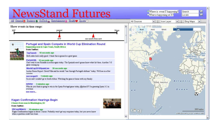
Figure 2: Screenshot of Spatio-Temporal Twitter Demo

we report correct and incorrect numbers for both future and non-future events. so as to show how often the events were correctly identified. Unlike the analyses by [14] and [24], we do not report accuracy on "TIMEX" expressions; we only report the results of the complete temporal identification of dates in news. The results can be found in Table 1.