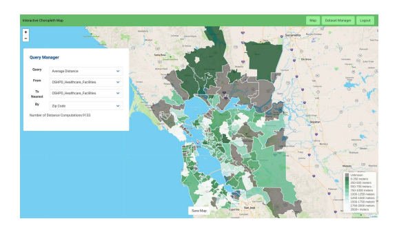
Figure 6: Visualization of the average distance between healthcare facilities.

We first visualize the driving distance between public schools within California. For this, we use the "California Schools 2018-19" dataset [2] by the California Department of Education. The dataset consists of 10,070 K-12 public schools throughout all of California. We visualize distances around the San Francisco Bay Area organized by ZIP code in Figure 5.