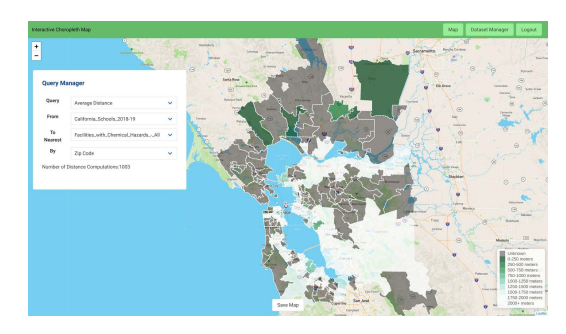
Figure 7: Visualization of the average distance from schools to the nearest chemical hazards.