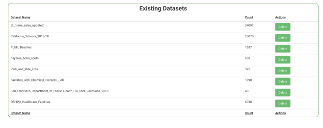
(b) View Existing Datasets