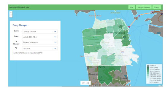
Figure 8: Visualization of the average distance from Airbnb to the nearest boba shops.