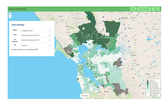
Figure 5: Visualization of the average distance between schools.

To demonstrate the types of Choropleth visualizations which can be produced by our system in real-time, we perform an initial case study on accessibility in the Bay Area. For all distance computations, we use Roads Inside Any Database [8, 10] which provides a dataset of roads as well as a prebuilt oracle for the Bay Area of California.