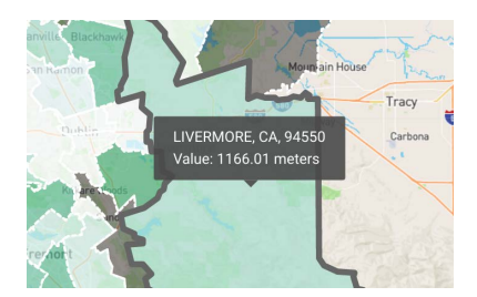
Figure 4: The inspector tooltip shows details and query values associated with each region on the Choropleth map.

3.2.4 Data Management. To allow users to quickly import new data, our system provides a management interface that allows users to upload CSV files containing new points of interest. The frontend parses the file and allows the user to select columns representing the latitude, longitude, and ZIP code. For ease of use, columns named "latitude", "longitude", or "zip" are automatically selected if available. After naming the new dataset and selecting the relevant columns, the user can upload the dataset to be saved into the server. Upon completion, the dataset appears under the existing datasets table and can be used to build queries. Our dataset management interface is shown in Figure 3.