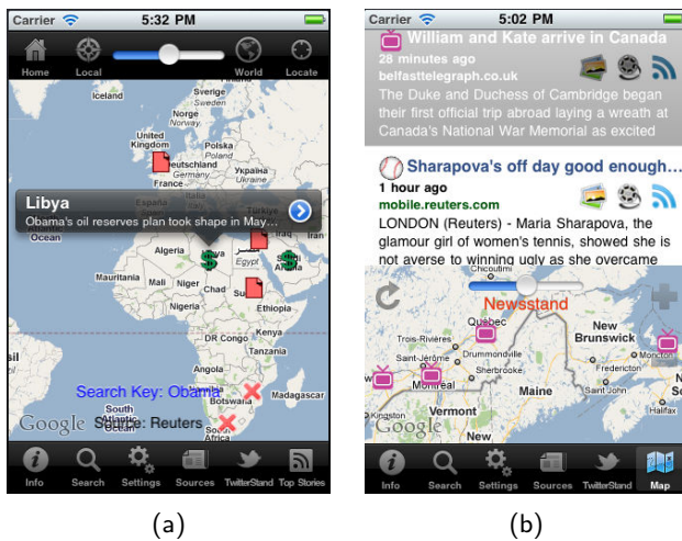
Figure 1: iPhone and iPod Touch screen shots showing (a) Map Mode once the marker at “Libya” has been tapped, and (b) Top Stories Mode assuming a left-handed one-handed preference setting. In the case of Map Mode, the markers are restricted to topics with a keyword of “Obama” and in articles in “Reuters”.

The feature-based variant simply returns the top k locations mentioned in articles about topic T or just article Y , which are detected by techniques such as in [4]. The actual output has two components. The first consists of brief details on the topic or article including a link to a representative article of the topic or the article itself, as well as icons denoting the presence of links to associated images, videos, and other articles on the same topic. The second is a map containing markers at the locations mentioned in the topic/article and hence are likely to occur (see Figure 1(b) and termed “Top Stories Mode”). Several topics or articles can be viewed depending on where on the output component the user is hovering (see Section 2.2). The value of k is controlled by moving a slider. The topics are ordered either by importance, or by time in terms of the one with the most recent article. A refresh icon button on the map (regardless of the mode) updates the map with the latest streaming news which enables users to remain current.