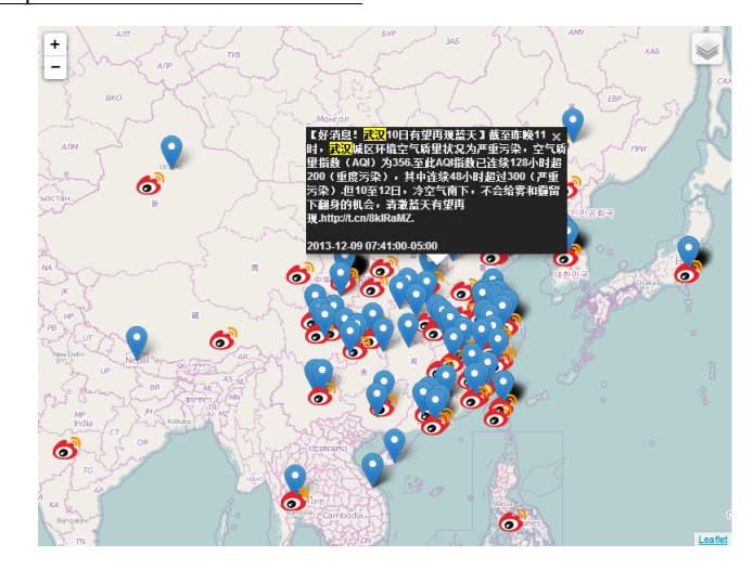
Figure 2 Web interface of WeiboStand. Weibo logos (eye shaped marker) show news clusters derived from Weibo. Blue markers show news clusters derived from RSS news sources.

A web client is implemented for visualizing the geocoded clusters as shown in Figure 2. In the figure, we show several news stories on a map query interface. They correspond to news obtained from Weibo or from RSS feeds. We mark the messages obtained from Weibo using an "eye" marker (Sina Weibo's logo) and those obtained from RSS feeds using a blue marker. By clicking the marker, the news story pops up with the toponym being highlighted. Our online demo is available from http://weibostand.umiacs.umd.edu/.