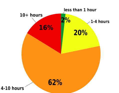
Figure 2. Amount of Time Spent on the Computer Each Day