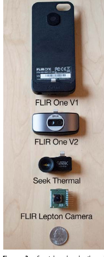
Figure 2: Smartphone-based thermal cameras (top to bottom): FLIR One (version 1), FLIR One (version 2), Seek Thermal. The fourth item is a FLIR Lepton Camera and connective housing that can be used for electronics projects (and hackathons).

Residential buildings, for example, constitute 95% of all buildings in the US and are on average over 50 years old [20]. Aging buildings often suffer from inefficient doors and windows, poor air seals, and degraded insulation. To help identify and address these issues, the US Department of Energy (DOE) recommends professional energy audits, which typically lead to 5-30% reductions in monthly utility bills and increases in structural safety [19].