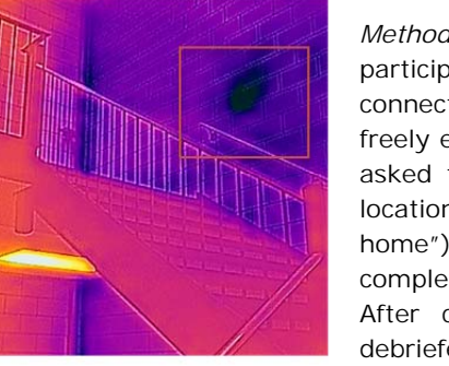
Figure 5: A participant in our pilot study surveyed a campus building and noticed an anomalous signature (center of red boxes) in an exterior wall that they could not explain. It was suggested, by other occupants of the building, that this was the site of a previous repair and that perhaps the wall was not restored to its previous condition.

To explore the role of citizen science/DIY volunteers in urban energy analysis and potential motivating factors, we designed a field study to examine their (i) use of smartphone-based thermal cameras, (ii) interests and experiences, and (iii) ability to capture appropriate energy analysis data. We piloted our procedure with three graduate students who had little/no experience using thermal cameras, described below.