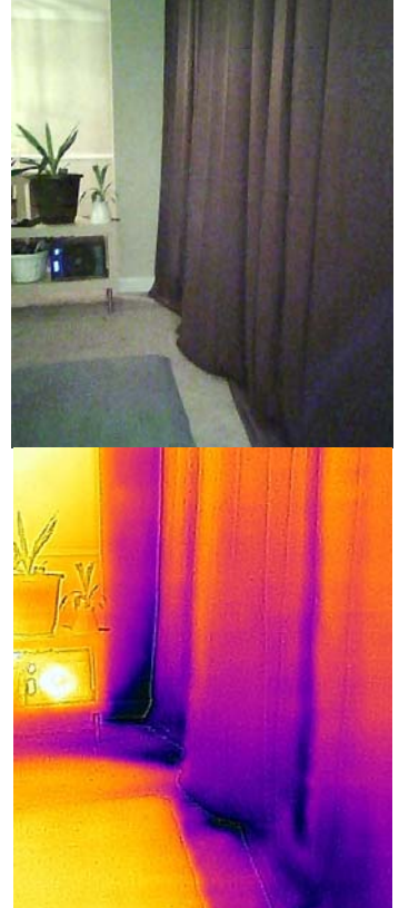
Figure 6: A participant in our pilot study described using a thermal camera to measure temperature exchange in her apartment resulting from the floor-to-ceiling windows (behind the curtains). The pilot participant took photographs over several hours and deduced that the rate of thermal exchange increased as a function of the difference between the internal and external temperatures; this experiment was designed to confirm a previous comfort concern.