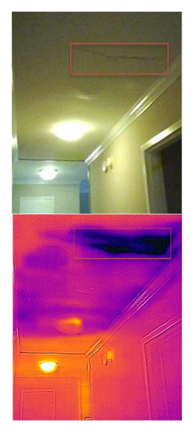
Figure 3: A participant in our pilot study noticed a small drip in the ceiling of her apartment and used her thermal camera to survey the extent of the moisture damage. To the unassisted eye (top), the leak appeared to impact only a small section of the ceiling where there was a visible crack; however, the thermal photograph (bottom) shows that the damage extended throughout the hallway. This photo (and others) was used to report the issue to maintenance personnel.

Role of Thermography in Building Energy Auditing Energy audits are aimed at identifying building energy inefficiencies through walkthrough inspections, computer simulations, and analyses of energy flows [17]. Walkthrough inspections are used to collect information on equipment efficiency, construction materials, and safety and comfort issues via direct examination and conversation with building occupants. This data is often complemented by more quantitative metrics ( e.g. , historical electricity records) [3].