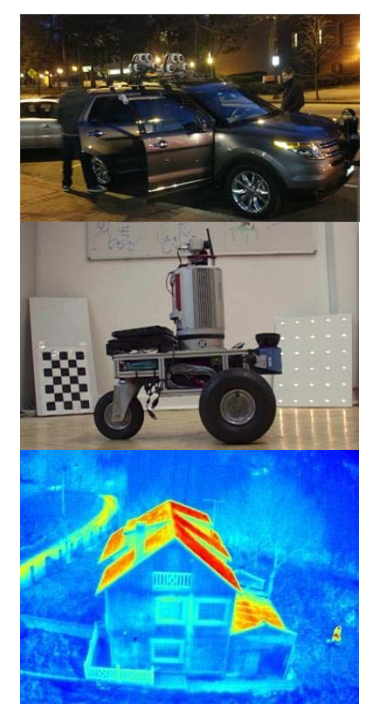
Figure 4: Examples of thermal data collection techniques from research literature and in industry: (a) Essess Inc.'s Google Street View like cars with mounted thermal cameras [12]; (b) Irma3D indoor thermal mapper robot [15]; (c) residential data from a UAV with a mounted thermal camera [11].

Another active area of research explores using autonomous or semi-autonomous robotic platforms ( i.e. , ground based and aerial) to improve scalability. Ground robotics are frequently employed for data collection tasks because of their carrying capacity and reliability [4,5]. For example, Nüchter et al. [15] demonstrated how ground robotics could be successfully employed to collect thermal data in large urban centers. Alternatively, UAVs are viewed as an attractive option because they can reach inaccessible regions of buildings (e.g., roofs) [6,13]. Additionally, Lagüela et al. [11] demonstrates that geographic sensing and 3D modeling techniques can be adapted to take advantage of UAVs as data collection platforms. However, urban scenarios pose navigation challenges for robotics and UAVs are limited by payload weight.