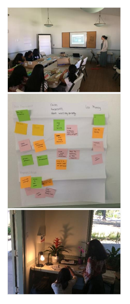
Figure 3: (top to bottom) An energy lecturette, an example of using design thinking techniques to ideate about energy issues, and one of our in-class energy measurement and calculation exercises with household devices.