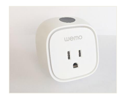
Figure 2: A programmable, Wi-Fi enabled Wemo<sup>TM</sup> smart plug like those used by students in our energy program during post-session, at-home activities.

Northern California. We report on how participants and their families reacted to our energy-based curricula, the benefits and challenges they perceived about using energy tools, and their preferences regarding the display of home energy data. We conclude with a brief discussion of the outcomes and limitations of this work before describing next steps for the program.