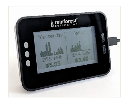
Figure 1: A Rainforest Automation<sup>TM</sup> EMU-2 device illustrates one type of energy display that families could use to assist them with understanding energy use and pricing at home.

Energy; Energy education; Tweens; Families; Behavior change; Smart meter data; Sustainability; Sustainable HCI