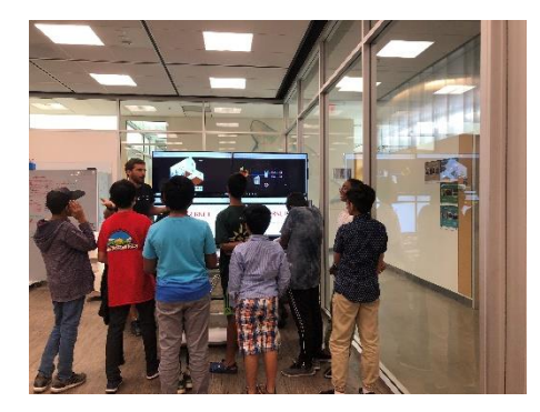
Figure 6: The KYEN program's last session features a tour of an energy lab where students learn about potential, future energy production, distribution, and demand response methods.

Figure 5: As they learned more about how energy data can be dis-aggregated ( e.g. , by usage type: base-load from always on devices versus other uses) via our supplementary visualizations, scouts become more interested in exploring the granularity of energy data.