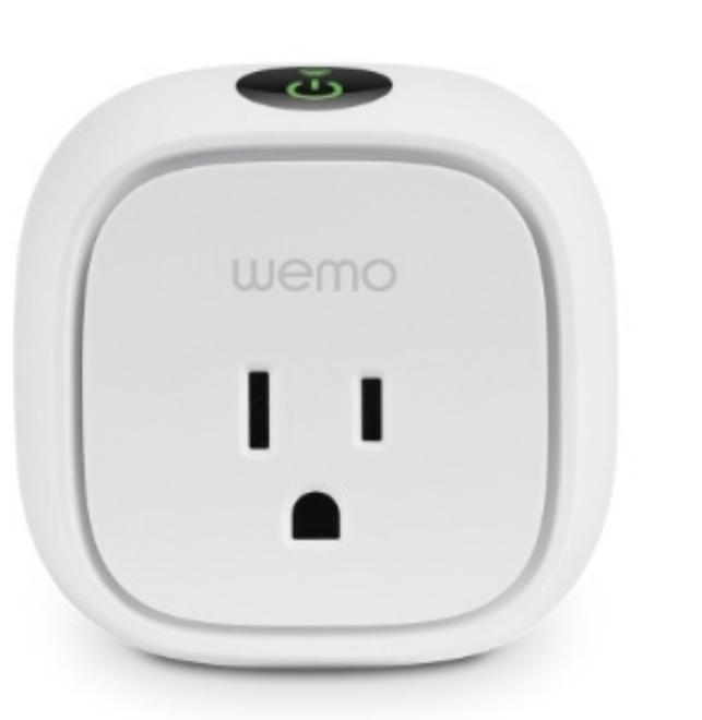
Students also perform athome activities that provide an opportunity to use home automation devices (e.g., smart plugs) to implement the strategies discussed in the workshops.