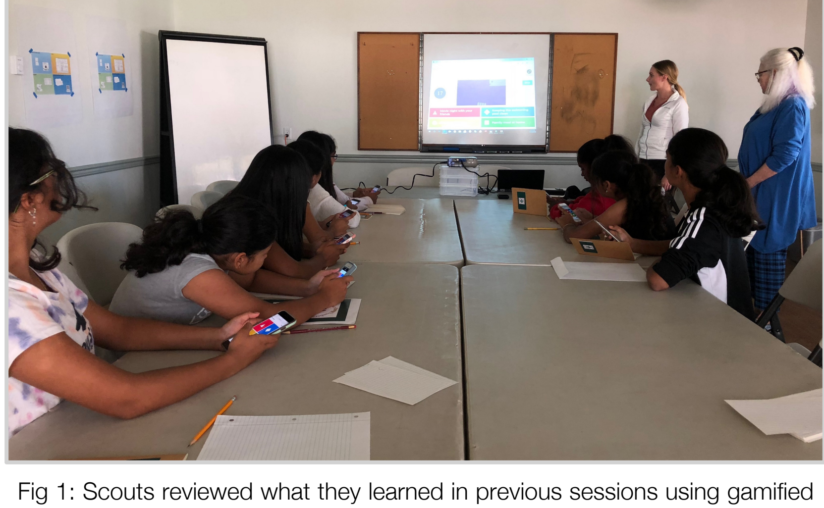
quizzes via the learning platform, Kahoot! (https://kahoot.com)

engaging (overall), but indicated that there were