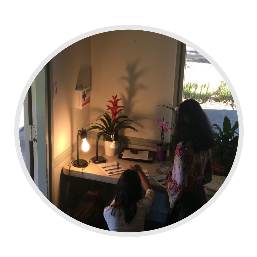
Team-based activities (e.g., measuring electric devices), design thinking techniques, and group presentations are introduced to help reinforce learning goals and brainstorm ways to save.

Students gather insights about their energy lifestyles by exploring energy data on their mobile devices and reviewing prototype energy visualizations specific to their household.