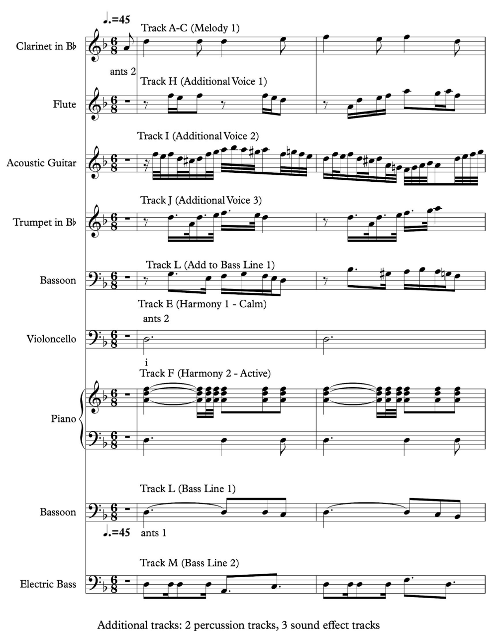
Figure: Sheet music for "The Ants Go Marching"; first song integrated into our playback system.