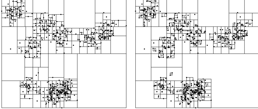
Figure 1: Sample output of ann2fig for a kd-tree and a box-decomposition tree.