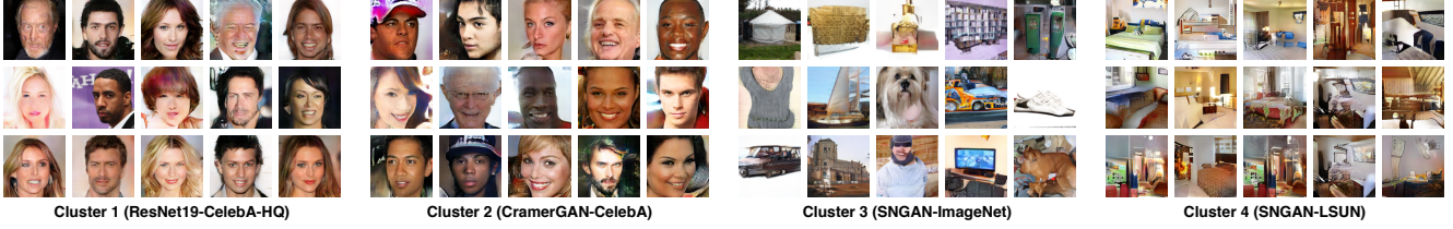
Figure 3. Samples from clusters discovered by our approach for unseen GANs with the majority class in parenthesis. It can be noticed that they are not just focusing on the object structure and semantics rather the underlying source.