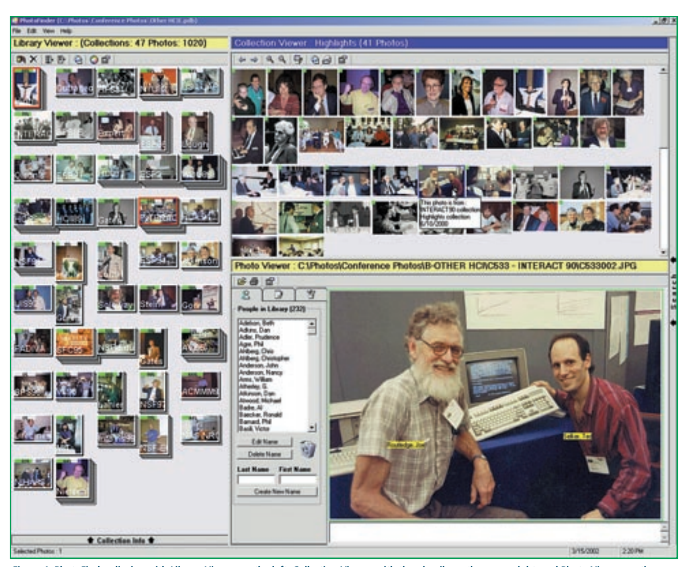
Figure 1. PhotoFinder display with Library Viewer on the left, Collection Viewer with thumbnails on the upper right, and Photo Viewer on the lower right. Library Viewer shows a representative photo for each collection, with collection information such as collection name, description, date range, location, number of photos, and percentage of annotations and captions. A stack represents the approximate number of photos in each collection. The Collection Viewer shows the photo thumbnails of the search result or the selected collection. The tool tip for each thumbnail shows which collection it comes from and the date the photo was taken. Photo Viewer shows the image of the selected thumbnail with annotations, captions and other individual photo information. The list of names, showing all the annotated people in the library, is used for search and direct annotation. Advanced search is possible by clicking Search on the right side of the PhotoFinder window.

add name annotations while browsing with a friend who suddenly recalls the name of a person in the photo. This design evolved over two years with several usability and controlled studies that dealt with issues such as thumbnail sizes, annotation acceleration methods, and search strategies [1, 2]. As the design was further refined from user feedback, the need for new services grew. Printing and sending photos by e-mail were easy to add, but exporting a full Web page was more of a challenge. The StoryStarter module enables users to export the photos in a collection to a Web site. The users need only to choose titles, image sizes, and caption options, and StoryStarter produces Web pages with Next and Previous links to make a complete story. A nice example is a student's story of his winter trip to Florida (www.cs.umd.edu/hcil/photolib/Florida2000).