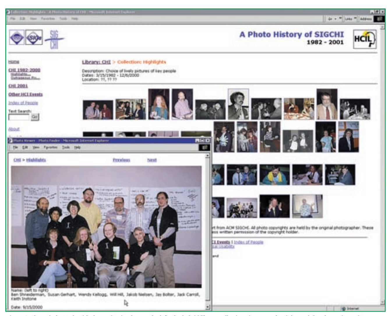
Figure 3. PhotoFinder Web with the navigation bar on the left, the hybrid library-collection viewer on the right, and the photo viewer in a separate window. The side navigation bar allows users to choose one of three libraries, go to the index of people in the database, or perform free text search. Once users choose a library, the right side of window becomes the library viewer, which shows the representative image of every collection in the library as the thumbnail. Clicking a collection thumbnail changes the library viewer into the collection viewer, which shows thumbnails of all images in the collection. Clicking any thumbnail in the collection viewer shows a larger image in a separate window with the photo information.

Take a look at the SIGCHI Photo History and let us know what you think. Does it help give you an idea of the history of this community? How might it be better?