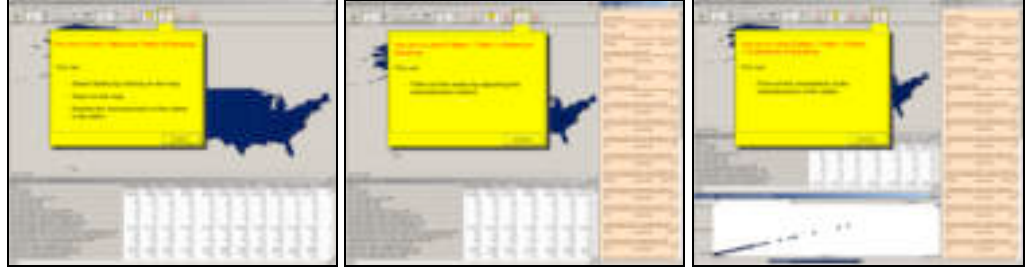
Figure 1 : Three different levels of the multi-layered approach, (a) the first level shows only the map and the data table (b) second level shows slider bar along with map and table (c) the third level adds scatter plot. A yellow introduction panel lists the features of the level and indicates the location of the level buttons.

We are investigating new ways to help users learn to use public access interactive tools, in particular for the visual exploration of government statistics. Our work led to a series of interfaces using multi-layered design, a new help method called Integrated Initial Guidance, and video demonstrations. Multi-layer designs structure an interface so that a simpler interface is available for users to get started and more complex features are accessed as users move through the more advanced layers. Integrated Initial Guidance provides help within the working interface, right at the start of the application. Using the metaphor of "sticky notes" overlaid on top of the functional interface locates the main widgets, demonstrates their manipulation, and explains the resulting actions using preset activations of the interface.