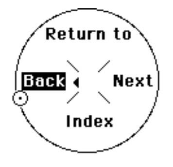
Figure 6: This pie menu appears with a right button mouse click. It allows to turning pages, returning to the previous article or jumping to the Index. For example to turn to the next page, users drag the mouse to the left and release the button, thereby mimicking a page turning gesture.