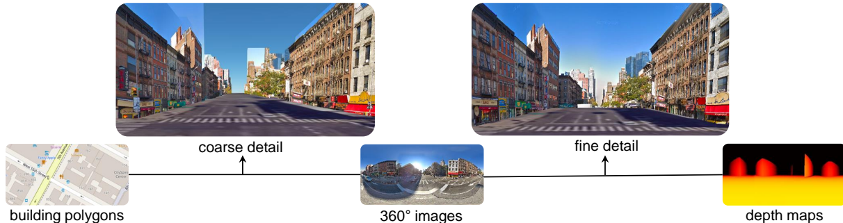
Figure 1: Results and overview of our interactive reconstruction pipeline. Our system is available at https://geollery.com .

Augmentarium, Department of Computer Science, and University of Maryland Institute for Advanced Computer Studies University of Maryland, College Park